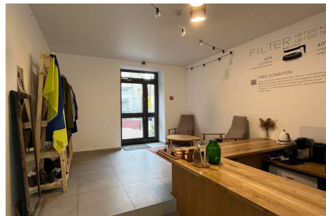
WeCare Center in Ivano-Frankivsk

A significant challenge that continues for Ukrainians in this season is finding work. We have also seen the number of new orphans who have lost their parents in the war increase dramatically.