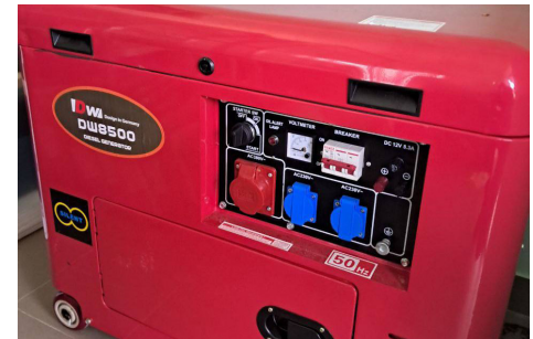
Generator for a bigger church in Yezupil, Ivano-Frankivsk region