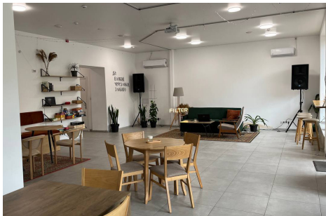
WeCare Center in Ivano-Frankivsk

Millions in Ukraine have relocated to the West, and others have returned from European countries, finding it easier back home. Many of the WeCare Centers cover not only peoples' immediate needs but also work on restoring their neighborhoods and planting new church communities.