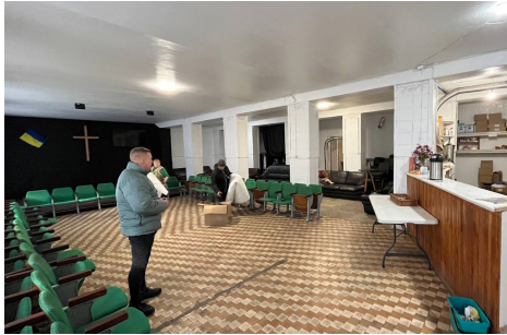
WeCare Center in Hostome

W eCare Centers from Ukrainian Baptist Theological Seminary are in 17 locations, working with local churches to show Christ's love with humanitarian aid, counseling, and resettlement decisions.