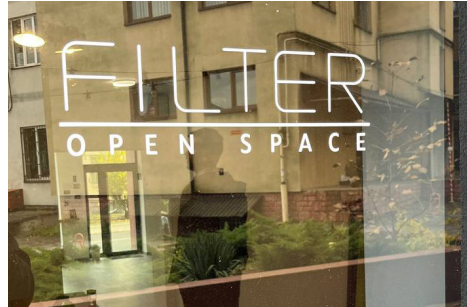
WeCare Center in Ivano-Frankivsk

A significant challenge that continues for Ukrainians in this season is finding work. We have also seen the number of new orphans who have lost their parents in the war increase dramatically.