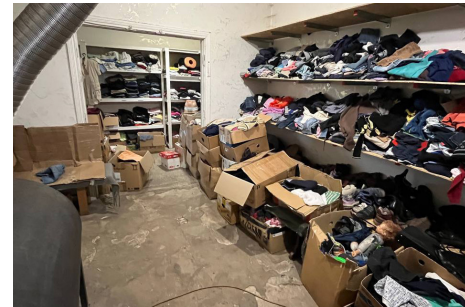
Warm clothes at WeCare Center in Hostome

Thank you in advance for giving towards our Winter Warmth program once again.