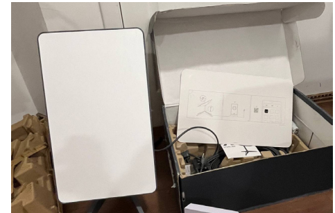
Starlink for a brother in Christ that serves in Kharkiv region