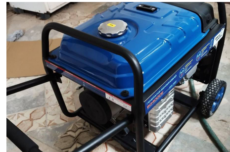
Generator for a church in Poberejja, Ivano-Frankish region