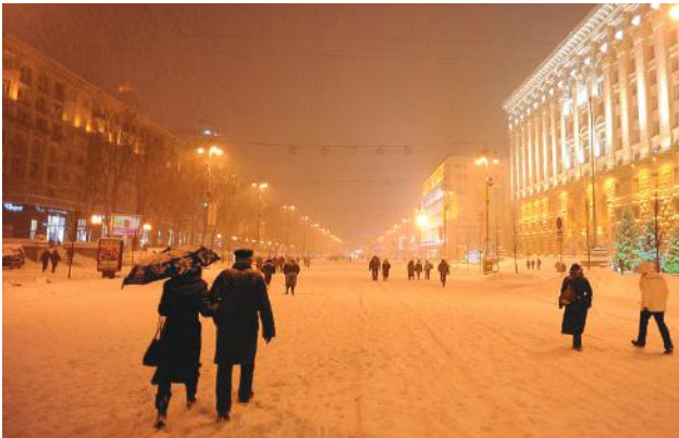
Khreshchatyk street, Kiev, Ukraine

The United Nations Office for the Coordination of Humanitarian Affairs says up to 4 million people in Ukraine are facing a “desperate situation” as winter progresses in Ukraine. The country is in its fourth year of war in the eastern regions—a conflict that has claimed up to 10,000 people and injured 23,500 others. Spokesman Jens Laerke said most of the people in urgent need are in the separatist