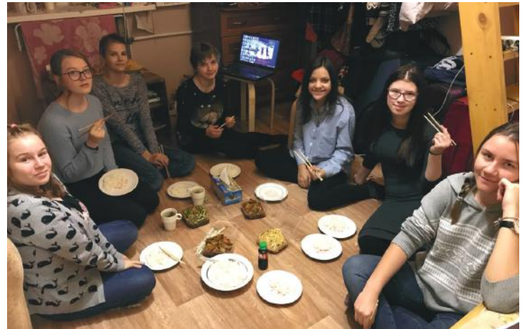
The girls who have graduated from the home meet weekly.

and regular families. We read the Bible together, encourage each other and pray for one another.