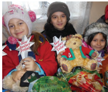
Immanuel's Child brings Christ's love to Russian speaking children.

Thank you for your generous donation that makes all this possible! ♦