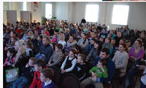
The children who pa