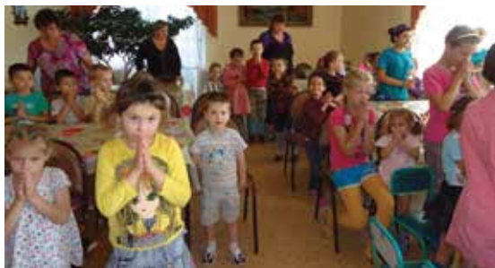
The children of Orphanage #5, learning of God's love.

With your help, we continue our Orphans Reborn ministry in children's home No. 5 in the city of