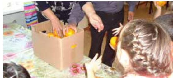
Gifts of food and other aid through the churches can make lasting impressions even among the staff!

Heart," "Jesus is My Best Friend," and "The Commandment of God: Do Not Steal." They purchase and take fruit and other things the children