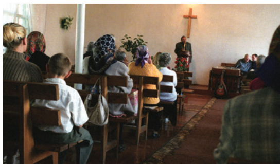
Evangelical churches across Russia may be facing renewed opposition soon. Please keep them in prayer!

Hundreds of Russian-speaking missionary pastors are being sponsored and establishing churches to reach their regions with the Gospel. Bibles and doctrinally sound Christian books are being distributed. Fruitful children's ministries such as summer camps, Orphans Reborn , and Immanuel's Child at