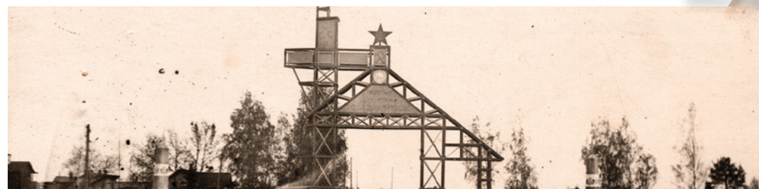
An old Soviet border gate from the Cold War era. We need to press on reaching Russia for Christ before the gates close again.