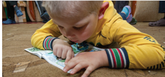
Reaching the next generation for Christ is a vitally important priority for the churches SGA serves across the CIS.