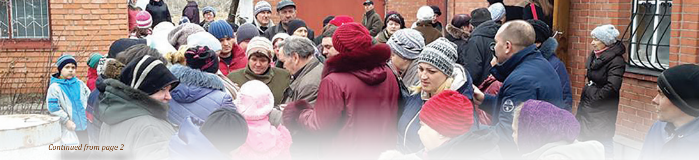
Continued from page 2

believers who were secretly listening to hand-write Bible verses to feed hungry souls the Bread of Life. Thousands of men and women received Bible training over the air and by correspondence initiatives. With the Lord Jesus as her Champion, His church overcame all the opposition that evil men could throw their way.