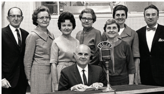
Shortwave Gospel radio penetrated the Iron Curtain and many were saved as a result!

We were shocked because it is a major violation of the substantial freedom of religion clause in the Russian constitution. We were shocked by the law because it appears that the purpose is to stop evangelical churches from carrying out the Great Commission of our Lord . . . Go therefore and make disciples of all the nations, baptizing them in the name of the Father and the Son and the Holy