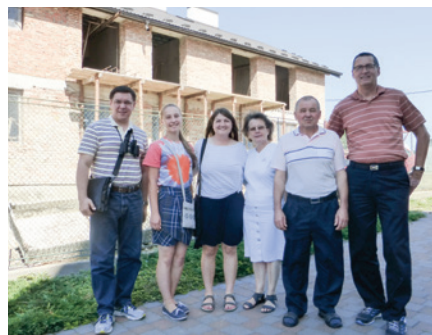
A Seniors' Home being built by a church with a burden.

Your part is critical—to pray and provide—for which we are thankful. Every missionary pastor is asked to send a quarterly report and when they do so, it is always expressing thanks for faithful partners. Let's carry the load together even when we don't understand how God is at work.