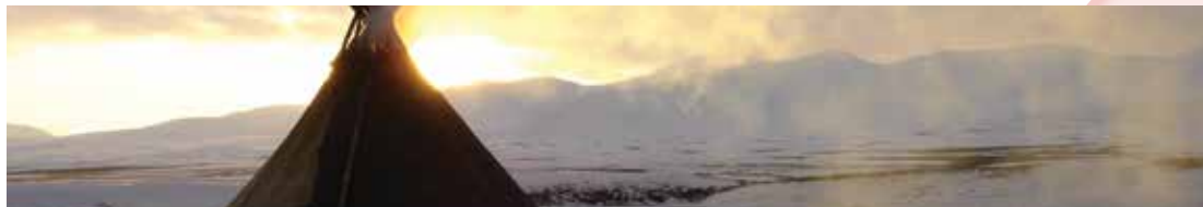
In Russia's Arctic north, many families still live in wigwam-like structures and endure the brutal climate.

Many Christians who suffered for their faith did not ever return to their homes. They are now with the Lord, and for them, sorrow and pain are no more. May God bless us and enable us to be faithful in our generation, and help us hold to our faith no matter what circumstances arise. We thank you—our friends and supporters—who helped make this journey possible, and helped us to encourage our brothers and sisters.