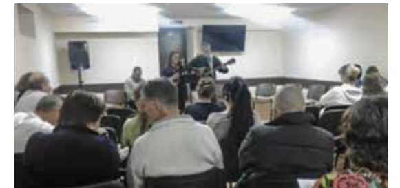
Bible studies and singing worship songs lead to opportunities to share Christ with refugees.

We invited Christian singers to participate at the camp and it brought comfort to the refugees. We had Bible classes and provided delicious food for them. At the end of the camp, many people thanked