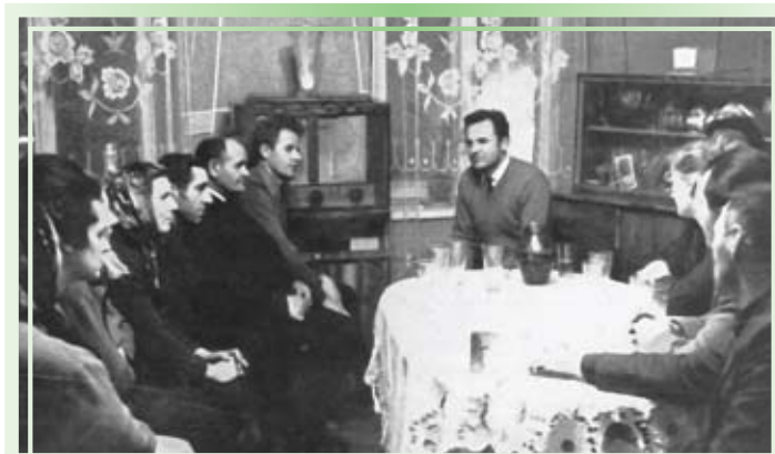
Russian believers listened secretly in their homes