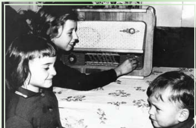
Children in the Soviet Union listening to SGA radio programs

There were programs that addressed concerns of the family. And young people were not forgotten. The program Amazing But True was